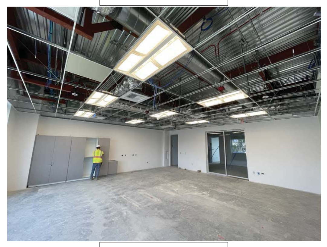
Chino HS Bldg. H Canopy